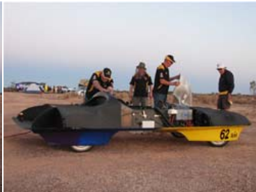
39 at dawn - few adjustments - tent city