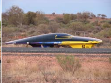
30 and you're off again