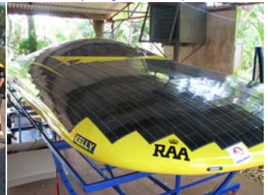
12 the solar shell