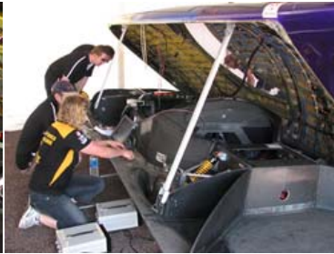
6 computer checking the system