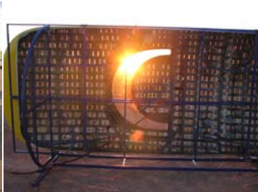
34 the sun shining through the solar panels