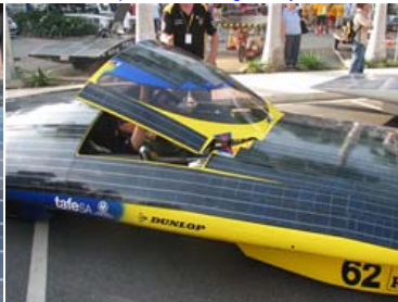
10 the way in & out - don't tread on the shell