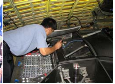
4 working on the electronics