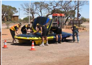
40 all hands on deck