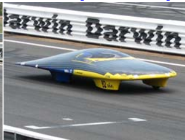
left = 17, centre = 18, right = 19 - time trials - Hidden Valley Raceway - Darwin