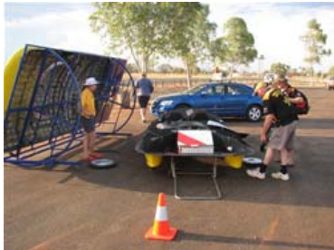
33 shell off - recharging the batteries