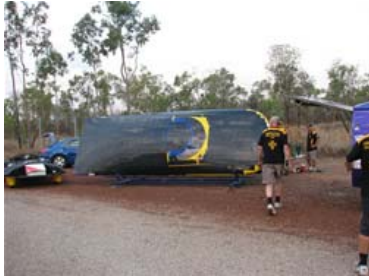
25 batteries charged