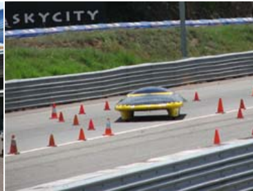
left = 15 - right = 16 - scrutineering - turning circle, acceleration etc all checked