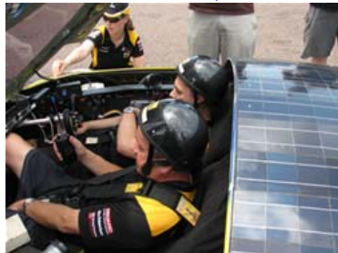
9 one driver, one navigator