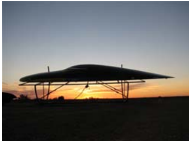
37 the shell silhouetted at dusk