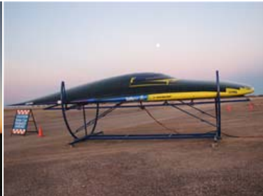
38 the view at dawn