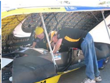
43 a closer look