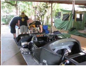
2 Without the outer shell of solar panels