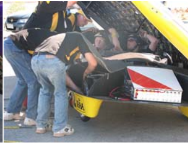
7 Mechanics - Tyre changing