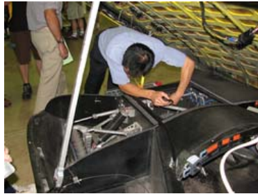
5 under the solar panel