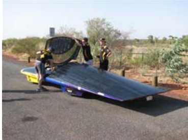
29 - 3 to 4 hours later - change team