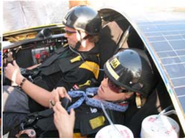
26 driver & navigator seated