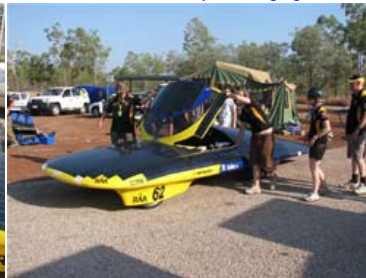
11 preparation to move