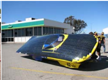
42 final adjustments