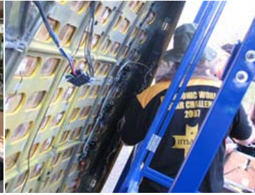
3 Under the solar panel