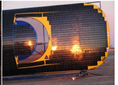
36 the intensity of light as energy