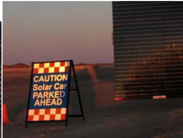
35 compulsory signage alerting others