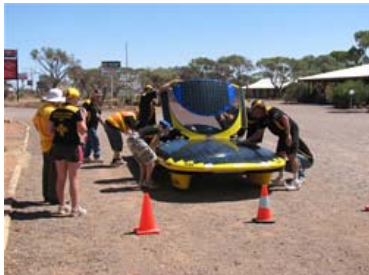
41 getting ready for another day