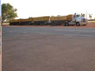
31 companions you meet on the way