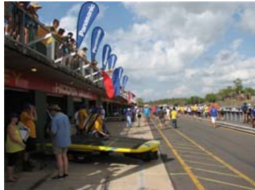
left = 13 - right = 14 - pit lane Hidden Valley Raceway, Darwin