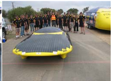
44 the last stop

Images courtesy of the 2007 TAFE SA Team Members - © 2008 For permission to use images for promotional reasons - email: gerry.jordans@tafesa.edu.au