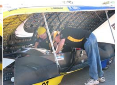
8 adjusting the control panel