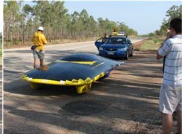
28 the observer checks you off