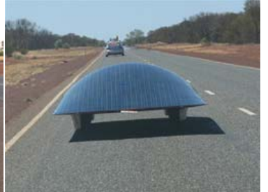
32 from the rear - like a tortoise on wheels