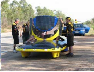
27 the lid is closed