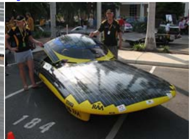
20 scrutineering over - let the challenge begin